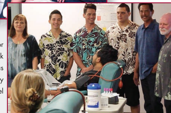
The Rasmussen family sharing their story with blood donors before Thanksgiving.