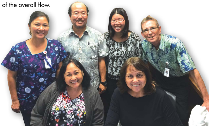
New title, but same familiar faces. BBH's collection specialists will be there to get your blood donation experience off to a great start.

We are excited to announce registrars were recently promoted and trained as collection specialists. That means they'll be with you from check-in, through the mini-physical and DHQ review, until you're comfortable and ready for our phlebotomists. Their growth will benefit donors by improving the donation experience with simplified processes and better coordination of the overall flow.