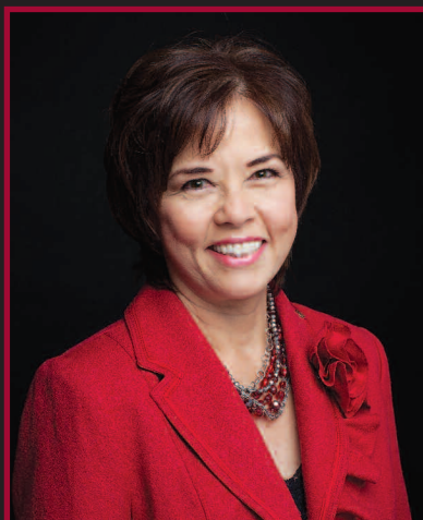
On The Cover